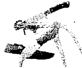
NRA MICARTA & BONE KNIFE ON TURKEY FEATHER/WANTLER HOLDER

Cash Bar Open All Evening Banquet Ticket - $45 each Couples $85 TICKETS AT THE DOOR $55 each *Benefactor Ticket - $125 : One Banquet Ticket, $160 worth of Bucket Tickets *Big Shooter Ticket - $250 Includes: One Banquet Ticket, $200 in Bucket Tickets, 3 "Top Gun" Tickets and choice of one (1) of the gifts below